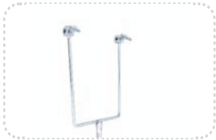
Steinmen Pin Holding Clamp