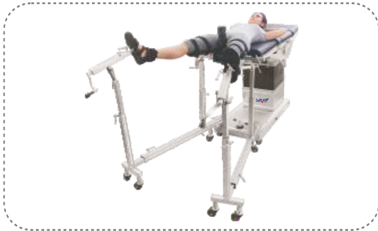
Patient Positioning For Neck Of Femur Nailing Traction (d.h.s)