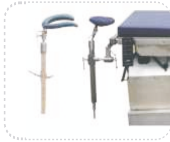
Head Rest device for prone, Spine & Lateral Position