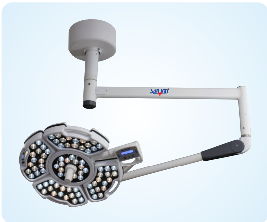
Model : Petal 4