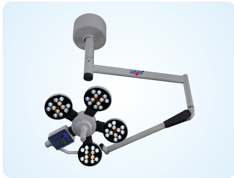
Fine Lux 4