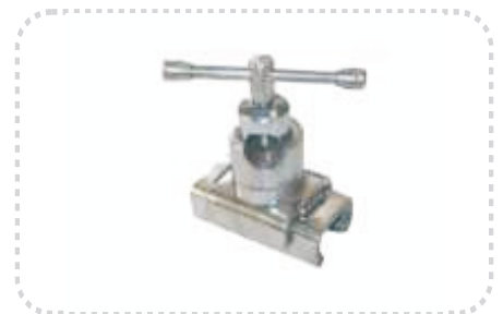
Crutches Holder Steel Clamp