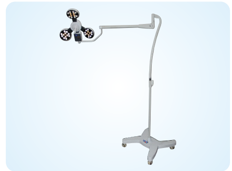
Fine Lux 3M