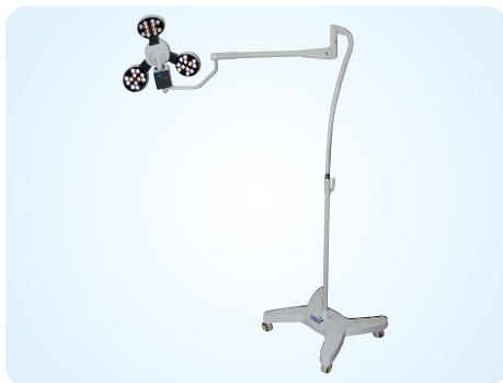
Fine Lux 5M