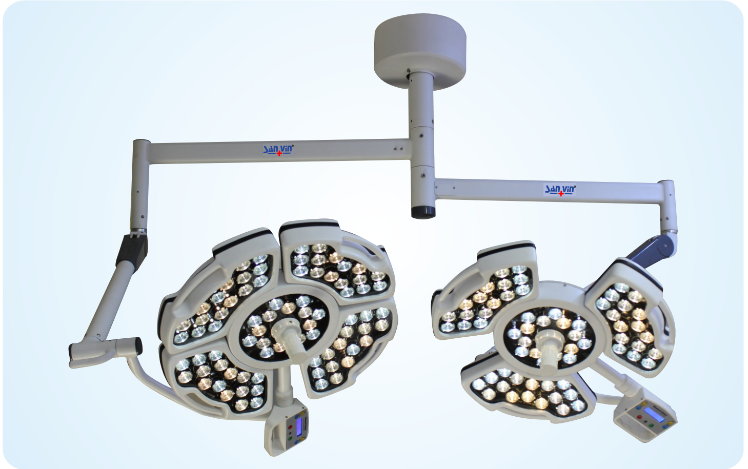
Model : Petal 43