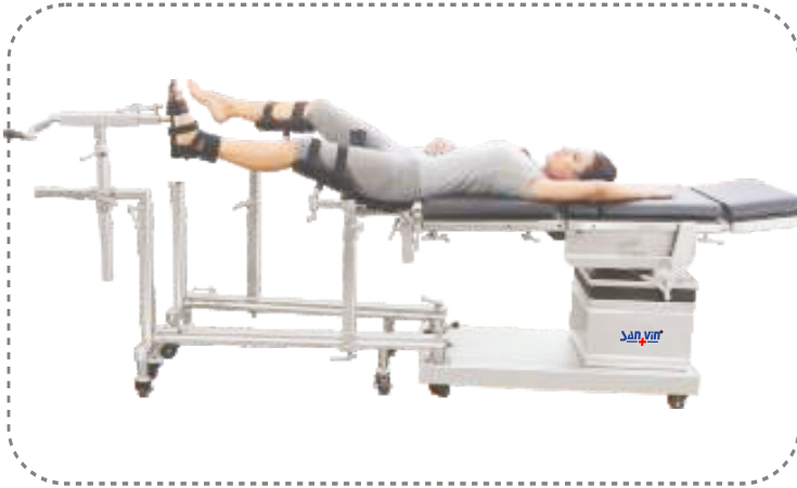
Tibia Bone-nailing Position