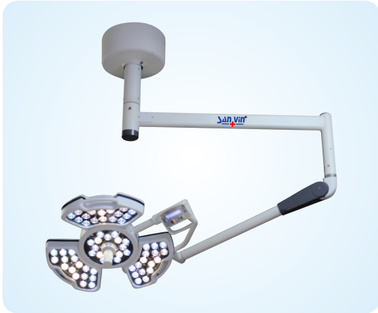
Model : Petal 3