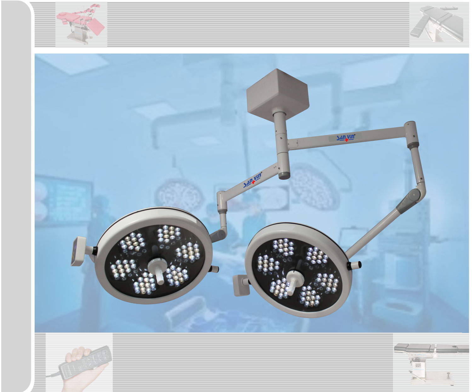
Model : Glow 6060 Double Head