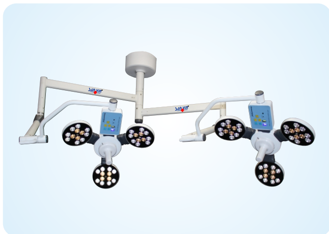
Fine Lux 33