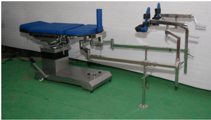
Ortho Attachment Hanging Model