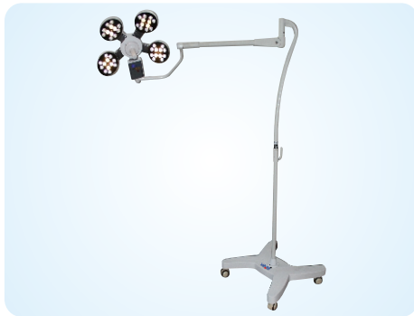
Fine Lux 4M