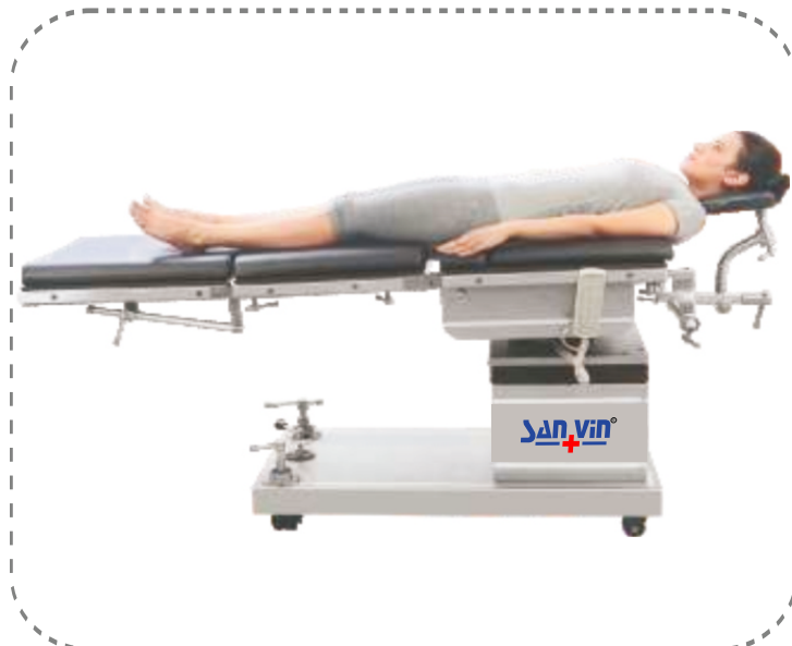
Head Rest device for prone, Spine & Lateral Position.