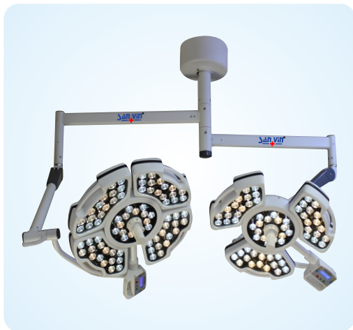
Model : Petal 43