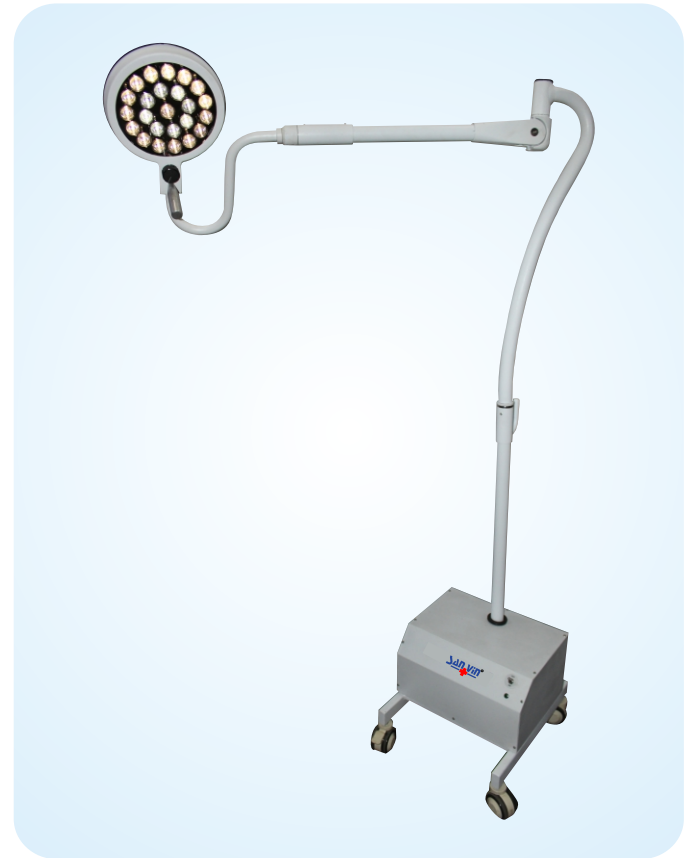
Micro M with Battery Backup