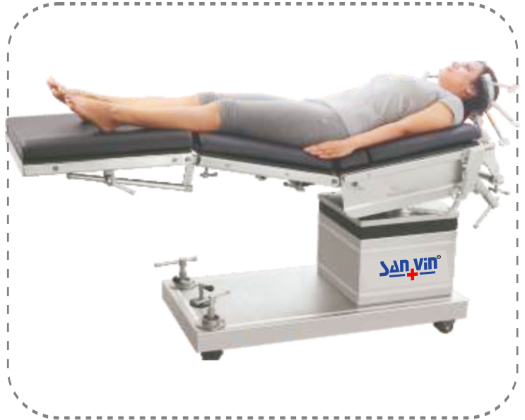
Neuro Skull Fixator in Spine Position & Skull Pins.