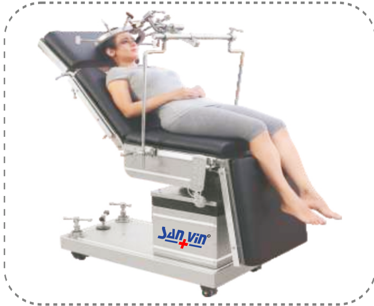
Sujita Head Fixator For Sitting / Prone Positions.