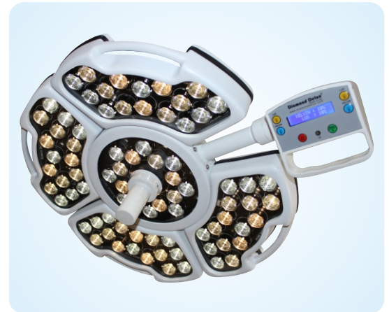
Model : Petal 4 Dome

Petal Series adapts to laminar flow technology with Finland optics, bulbs from Germany along with front safety glass from Mitsubishi Japan.