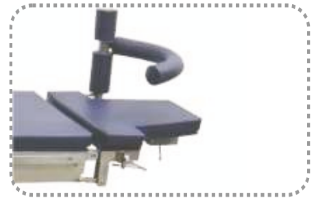
Femur Nailing Support