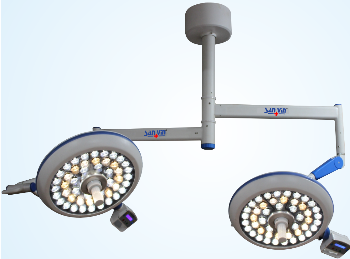
Model : Macro 500/500