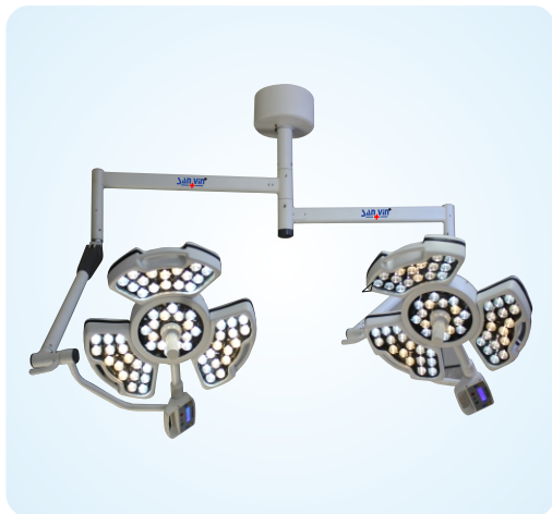
Model : Petal 33