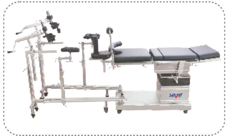
C-arm Compatible Electric Table With Orthopaedic Attachment