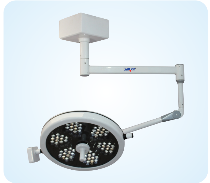
Model : Glow 60