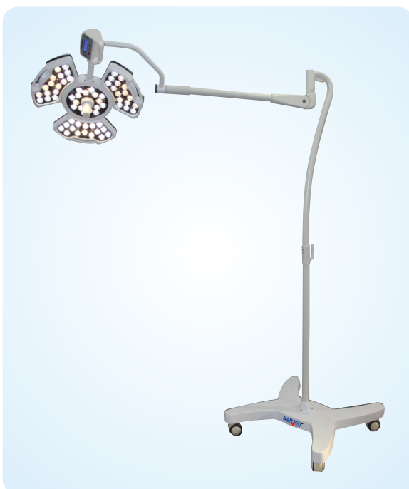
Model : Petal 3M