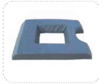
Spinal Bridges for prone position