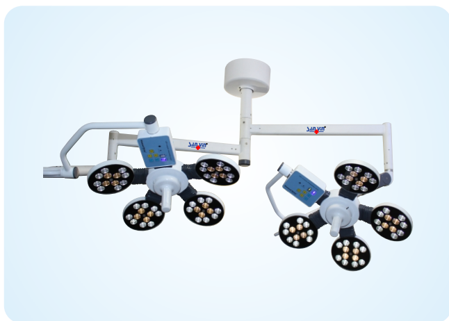
Fine Lux 44