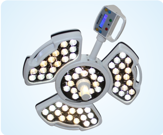
Model : Petal 3 Dome