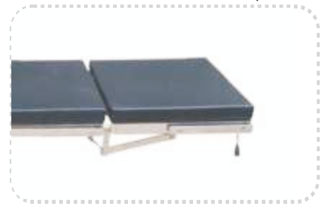
Water Proof Antistatic Rubber M