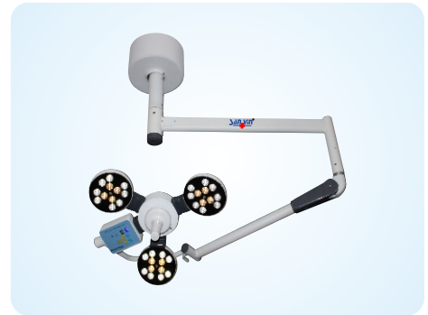
Fine Lux 3