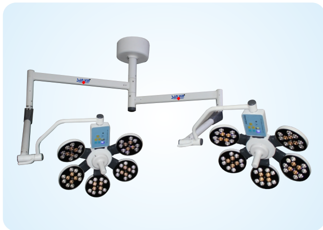
Fine Lux 55