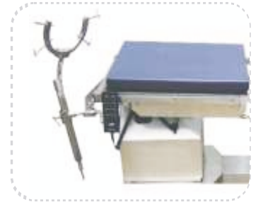
Neuro Skull Fixator Spine Position