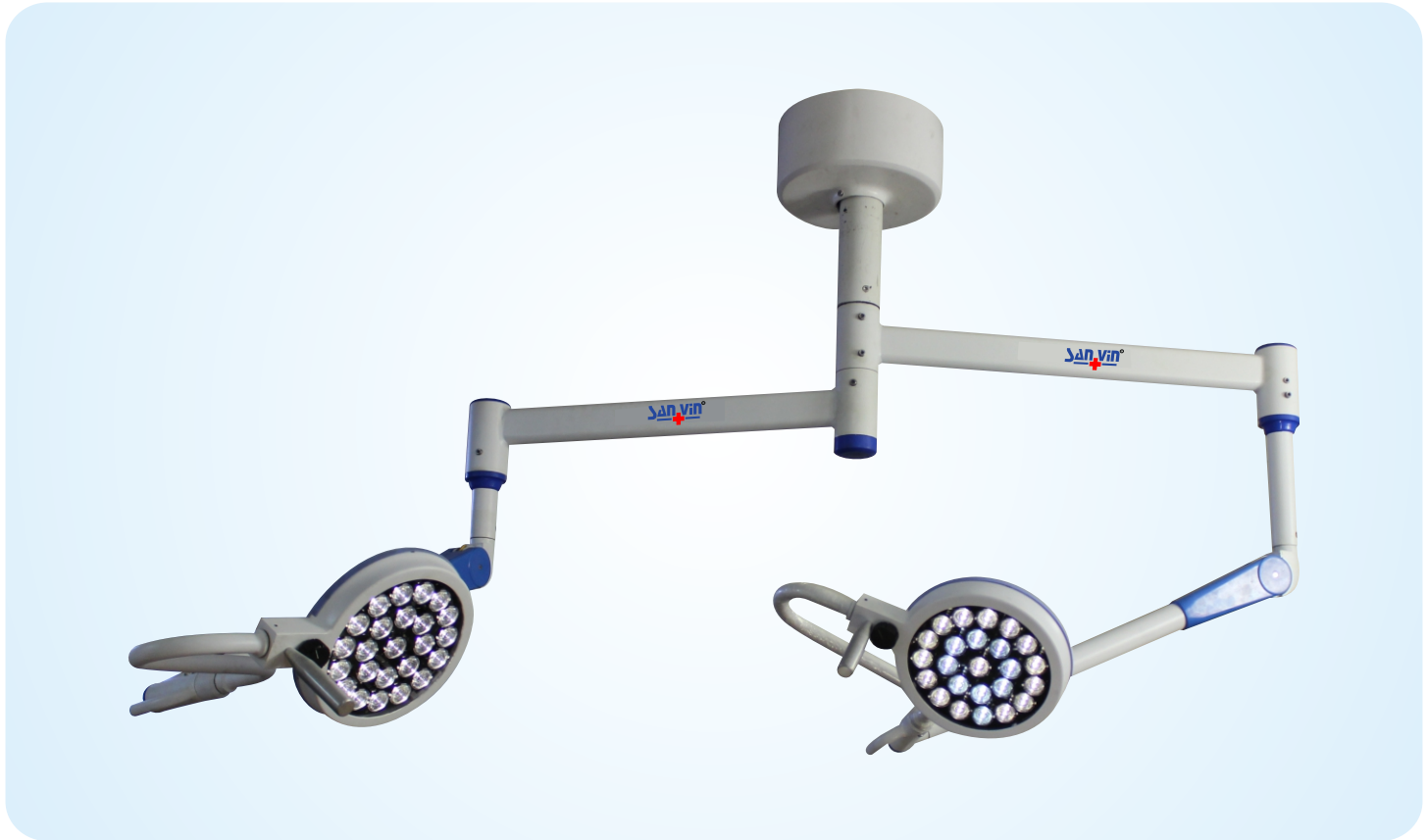
Model : Micro Ceiling Double Dome

Best solution for Minor OT/Dermatology, Hair & Skin Clinics, OPD's