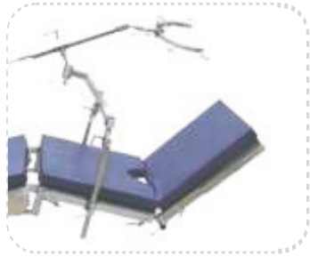
Neuro Sujita Head Fixator for Sitting / Prone Positions