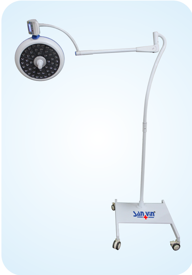
Model : Macro 500 M (Optional Battery Backup)