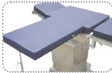
Radiolucent Operating Table with Stand