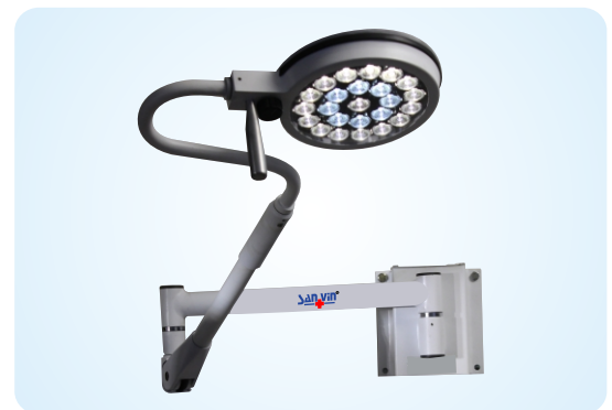
Micro Wall Mount (Space Saving Design)