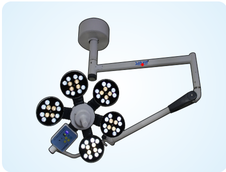
Fine Lux 5