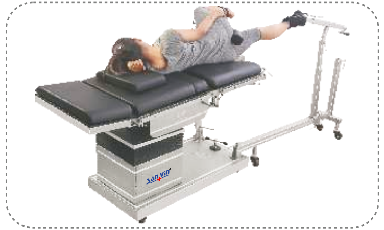
Femur Treatment And Lateral Position With Steinman Pin Holder