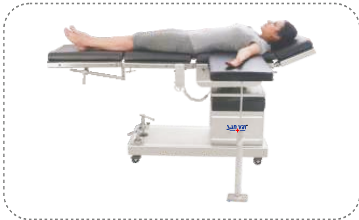
Hand Surgery Position