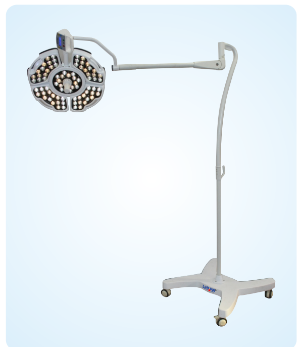
Model : Petal 4M