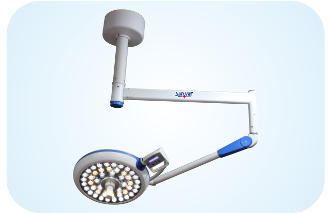
Model : Macro 500