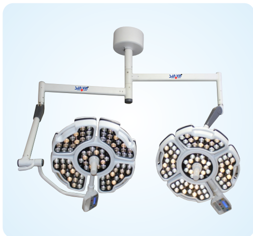
Model : Petal 44