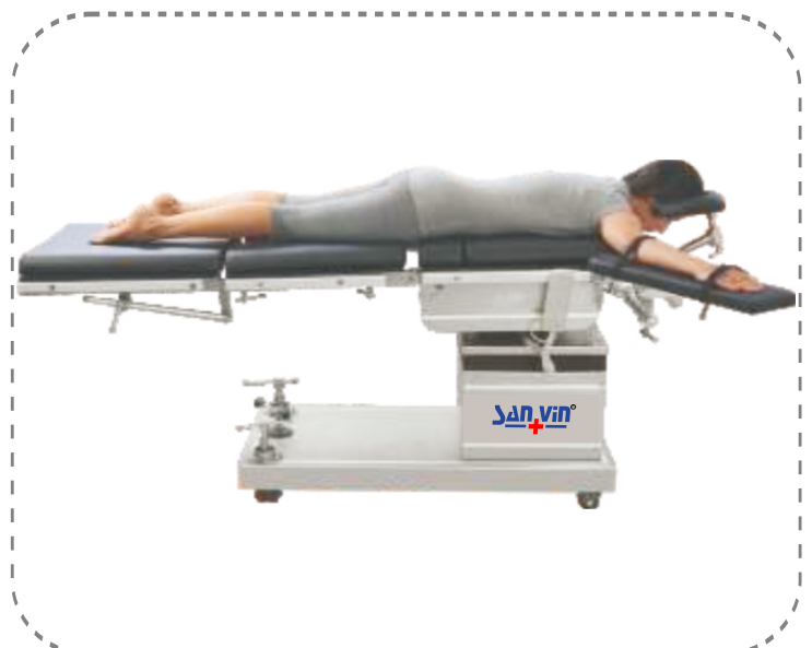
Spine Surgery in Prone Position Using Horse shoe Headrest Cushioned Spine Frame.