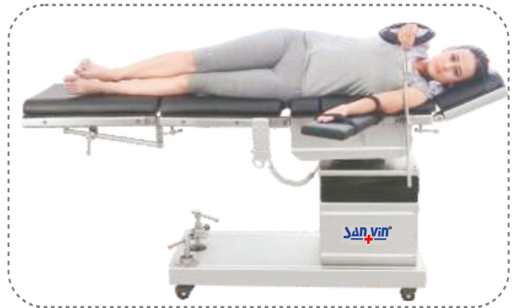
Humerus In Lateral